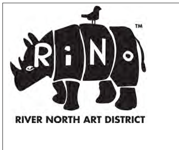
Branding mark for River North Art District in Denver, CO.