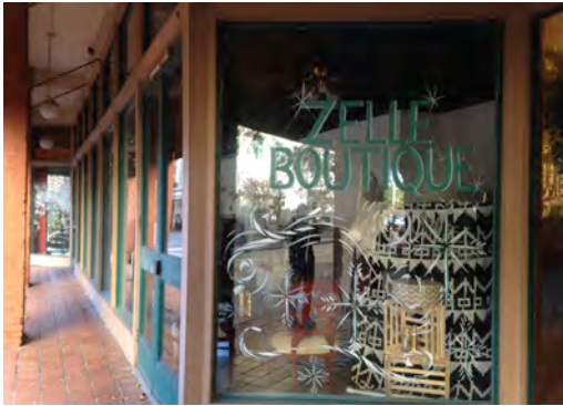
Houston Street Pop Up Shop during Winter of 2015