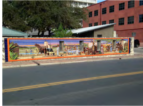
Tile mural by Jesse Trevino located along exterior wall of Casa Navarro