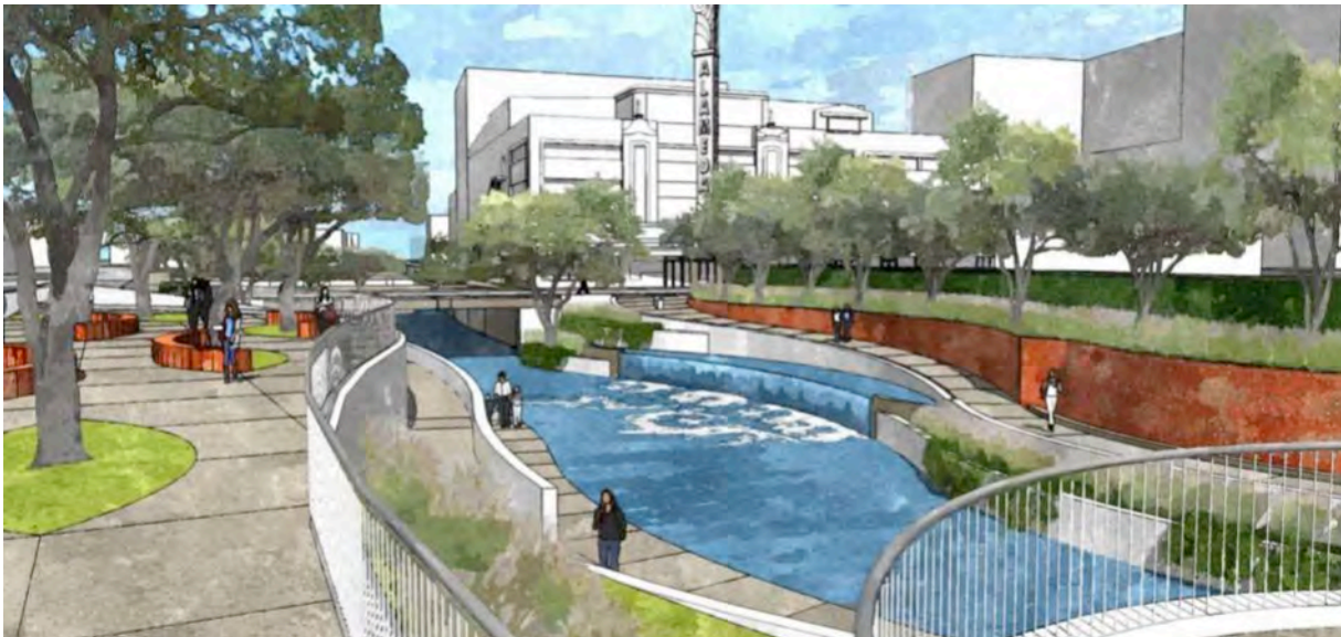
Rendering of San Pedro Creek presented by San Antonio River Authority