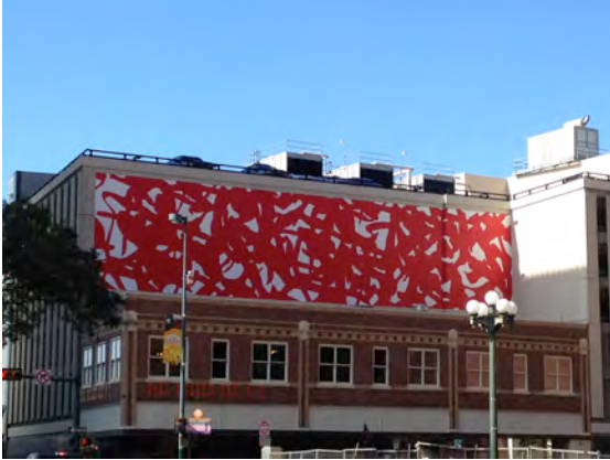
ADAM by Arturo Herrera, located in Zona Cultural across from Main Plaza