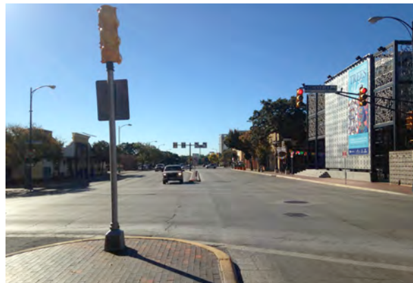
Intersection of Santa Rosa and Houston