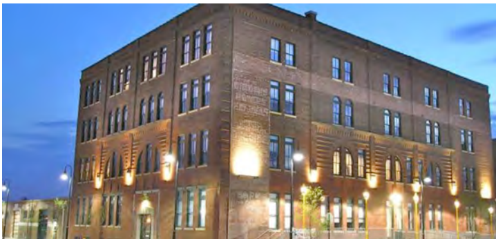
Downtown Council Bluffs, IA lofts redeveloped to artist housing by Artspace