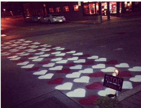
FIGURE 2.2.3 Downtown street with heart paintings

Stakeholders shared that a lack of “stickiness” or staying power was a common challenge on Houston Street, along with empty storefronts. By establishing the “distrito” and committing to using culture and the arts as a placemaking tool, the challenges become assets as the stickiness is reimaged in a new way by highlighting the street’s theatres, its strongest assets, and funneling that momentum into a ready inventory of empty storefronts without having to build new spaces. The creation of a theatre distrito is one option; however, if desired, micro-districts could be imagined along Houston Street as hubs of identity that Houston Street connects together, creating interest and a desire to see what the next block has to offer.