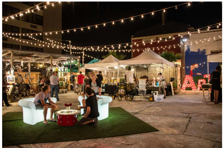
FIGURE 2.2.18 Pop-up nighttime marketplace

A night market in empty storefronts, surface parking lots or IBC Plaza at the River Walk can encourage makers, creators, and artists to set up temporary shops. These temporary shops will generate traffic through their individual networks as well as create a critical mass, sense of place and means to diversify the retail market on Houston Street. By utilizing IBC Plaza and stairs from the River Walk for a pop-up market, activators can encourage shoppers to transition from the River Walk during the day and a market during the night. 11