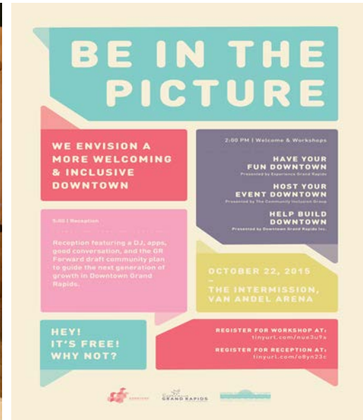
FIGURE 3.3.3 Community engagement strategies for informing public comment