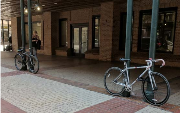
FIGURE 3.2.3 Current bicycle parking along Houston Street

and educating more riders and the benefits and ease of use that come with B-Cycle. With four locations just within the Houston Street Corridor, events, educational campaigns, and easy to understand signage should accompany these stations.