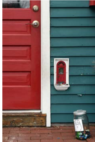
FIGURE 2.2.9 Downtown Fairy Doors

Art in unexpected places, especially on a level where children can notice them, provides an interest and activity for all ages. Examples such as the Fairy Door series in Ann Arbor mimic full-size doors but are designed for tiny visitors.