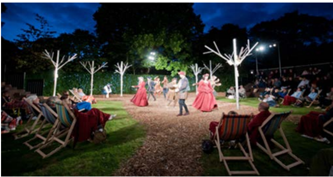
FIGURE 2.2.5 Outdoor performances

Activators can encourage theatrical groups to workshop scenes or perform rehearsals out in public spaces, either in parks or vacant storefronts. Much like athletes who exercise between games, many performers workout their bits, scenes, or their improv abilities as a means to keep fresh and agile. This presents an opportunity to showcase the community’s talent in an intimate way and creates interest in the distrito with something always happening on Houston Street. Residents may feel as though it is worth visiting because one never knows what may be witnessed or experienced.