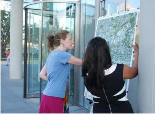
FIGURE 1.12 Participatory community engagement