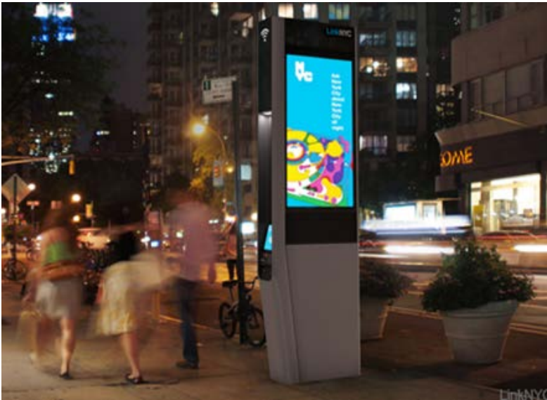
FIGURE 2.3.1 Digital Wifi and Smart City Interactive kiosks

This segment is the ideal location to introduce a streetscape, lighting, and signage overlay that embraces innovative approaches to all of these important elements in the public right of way. The key here would be to design the overlay in a way that rewards creative approaches to the above elements (within defined prescriptive ranges) through either reduced administrative burdens or incentivized results. These should be tied directly to implementations that embrace both the functional and decorative aspects of the elements.