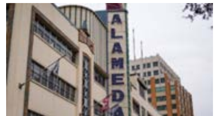
FIGURE 1.4 The Alameda Theater

"Zona Cultural" Segment: This segment includes many assets and is also the least defined area of Houston Street regarding development character and consistency. It stretches from the new Frost Tower development site to include the hospital, Milam Park, and the Mercado. This segment offers the most extensive opportunities for proactive activations rather than reactive activations.