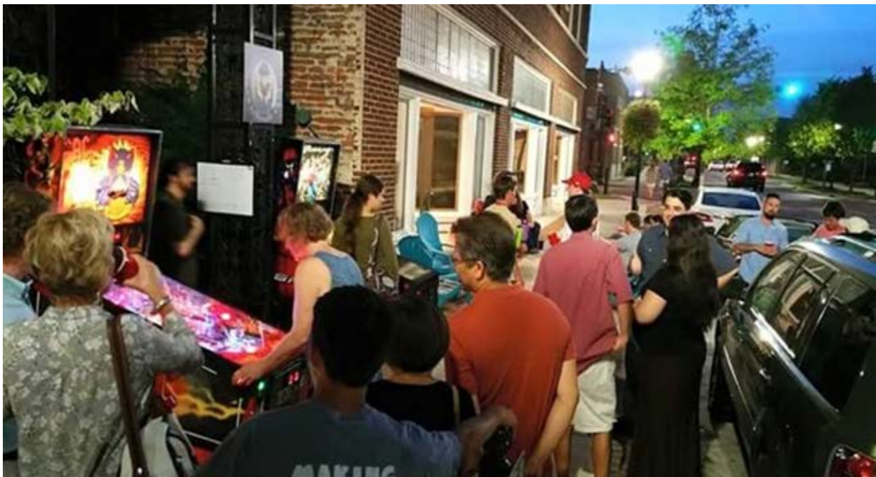
FIGURE 2.3.0 Outdoor Arcade Games

Though innovation is often tied to digital and virtual experiences, it is becoming increasingly common for the creative and innovative class to be drawn to retro play and other tactile experiences. The proliferation of “bar-cades”, pool halls, bowling alleys, dart rooms, and other tactile activities demonstrate that life “beyond the screen” is an important part of the innovation culture.