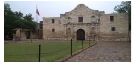
FIGURE 1.1 The Alamo

Alamo Segment: This segment is transitional in nature. It connects the largely tourist-centric area of Houston Street with the increasingly local-centric area. Due to the mix of uses, this segment will have the most diverse types of users. This segment stretches from Alamo plaza west beyond Broadway.