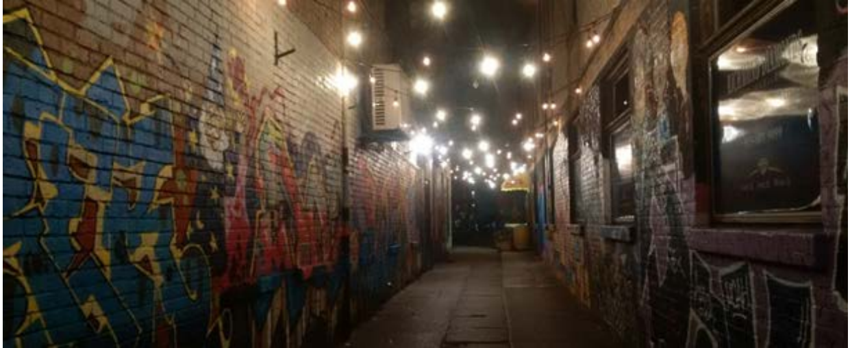
FIGURE 3.2.1 Activated Alleyway

Connectivity is often easier to achieve with proximity. Activation of Houston Street is much more likely to occur in a repeatable, reliable, (often in a more affordable and efficient) way where there is a concentration of magnetic experiences. The more disparate these experiences are, the more diluted and weaker the connectivity, and therefore the longer it will take for Houston Street to develop as a “third place” between the office and the home where something interesting is bound to be happening. In the short term, dedicated, concentrated activations of all sorts, most often near where the existing strongest recurring centers of energy already exist on the street, must be prioritized.