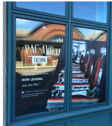
FIGURE 1.8 Storefront window activation