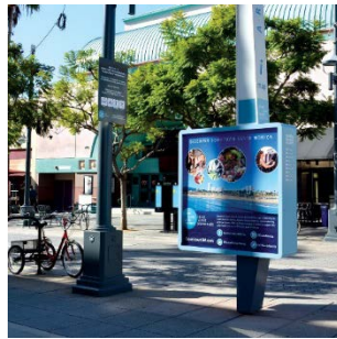
FIGURE 1.10 Downtown Santa Monica, Inc. wayfinding