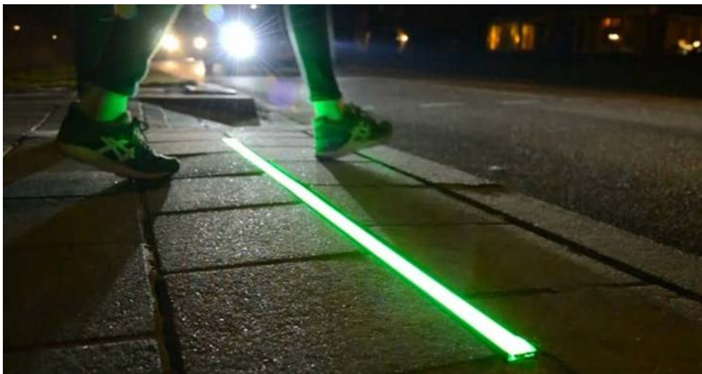
FIGURE 3.2.0 Illuminated sidewalk features

Let Houston Street aspire to the cultivation of innovation, adaptation, and experimentation. In the near-term, Centro can act upon this through strategic and consistent communications of pilot, pop-up, and temporary activations. In the mid-term, introducing free public WiFi along the street would connect Houston Street with the world. In the longer-term, partnerships with the city and others can manifest this through infrastructure and installations that implement smart city technologies that address environmental sustainability (water conservation, energy-efficient lighting, traffic-control sensors, sidewalk heat-shielding, and other smart city techniques).