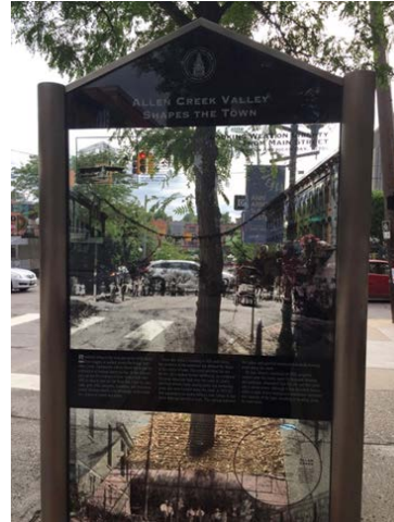
FIGURE 2.2.10 Translucent Historic before and after photos

Activators could use retail to help artists establish galleries or visible workspaces and studios on Houston Street. This creates a hyper-local retail opportunity where San Antonians can come to find numerous experiences and authentic assets.