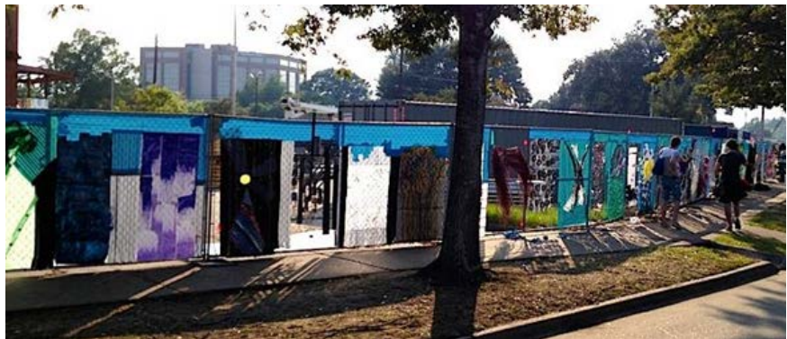
FIGURE 2.2.12 Construction Fence Art Work (example 2)