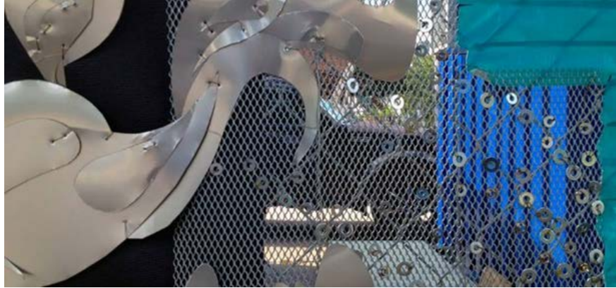
FIGURE 2.2.14 Construction Fence Art Work (example 4)

The intersections along Houston Street are opportunities for sculptural or light art. Sculptures that go across the street, up light poles or hang down provide visual interest, enhance corridor identity and can distinguish micro-districts or provide wayfinding elements.