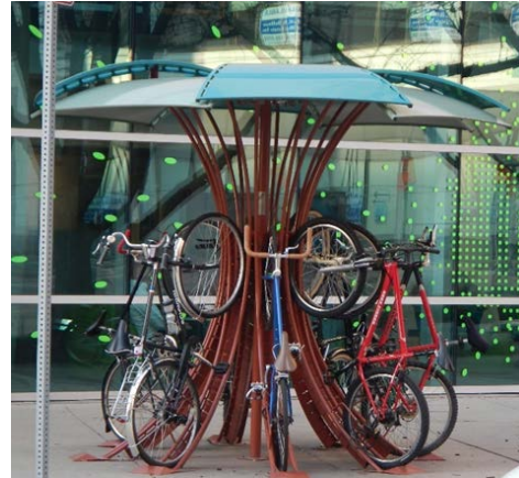
FIGURE 3.2.4 Bicycle parking under shaded element