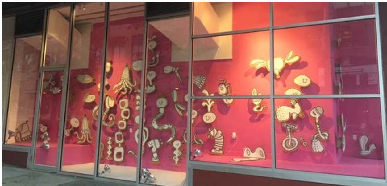
FIGURE 3.1.2 Example Spaceworks project in Tacoma, WA. Quick, inexpensive, and eye-catching, these projects can help activate storefronts along Houston Street.

Vibrant downtown retail is made up of a mix of shops and eateries, as well as services like spas, nail salons, bike repair shops, and barbershops. Done right, the mix in a focused part of downtown can be a draw for those in the greater metropolitan area while also meeting a good deal of the needs of those who live and work close by, and of visitors who like to shop and dine where the locals do.