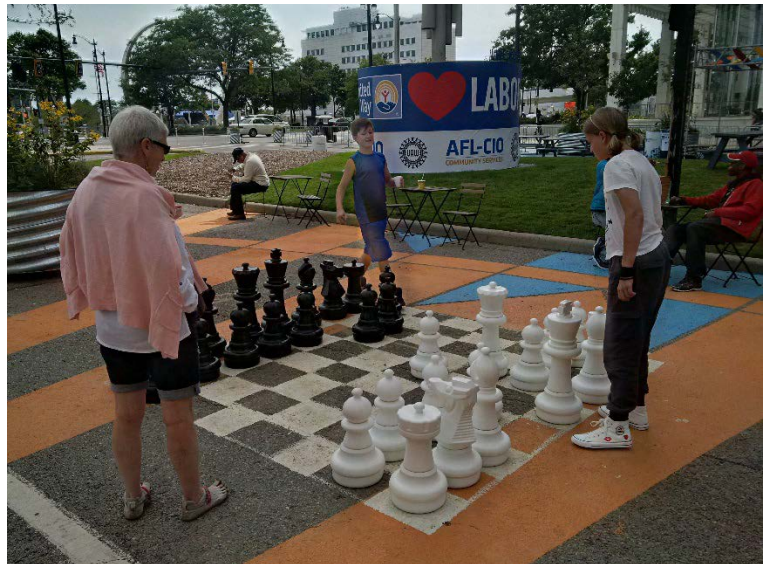
FIGURE 1.6 Outdoor chess activation in downtown