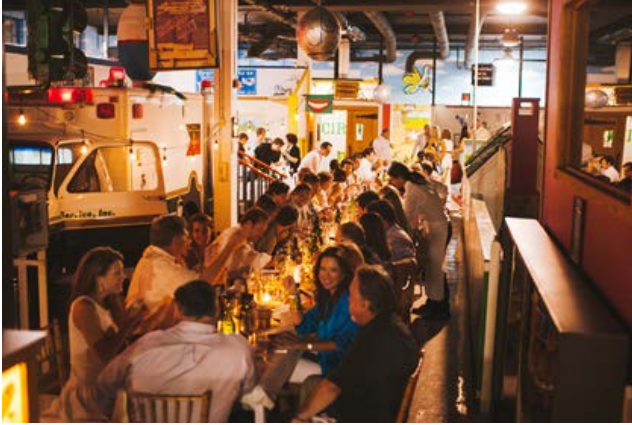
FIGURE 2.2.15 Outdoor Community Dining