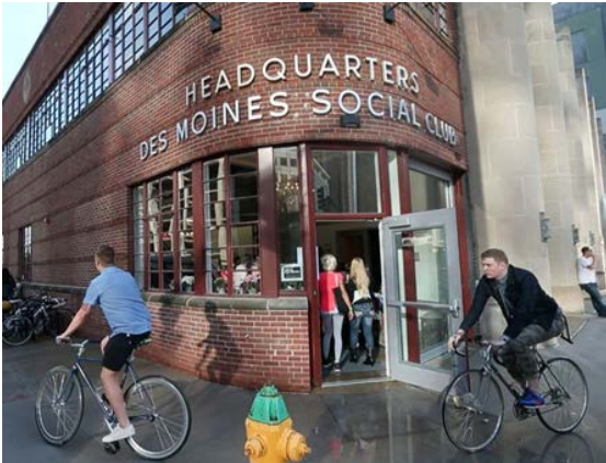
FIGURE 2.2.1 Performing Arts district

By highlighting the Majestic, Empire, Alameda, Aztec, and Texas 1 Theatres, along with the Tobin Center for the Performing Arts, efforts to create a theatre district will provide an annual schedule of events, show themes, performances, activation and bring awareness of these theatres and Houston Street. “Distrito” organizers could take an innovative approach and move beyond just a “performing arts distrito” to become the “performing arts distrito” inviting all types of art to occur in a live or accessible fashion as performance. Live paintings, live music, visible costume design work or set building become cultural assets that encourage bringing the creativity out where it can be seen, celebrated and more supported.