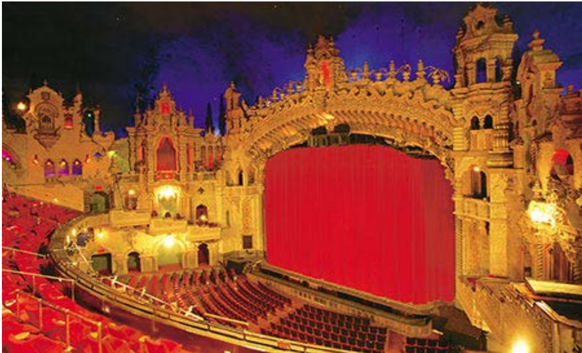
FIGURE 2.2.19 Majestic Theater interior 12

The distrito could create a marquee sign that serves at the ground level as a photo opportunity for visitors of the district. The sign could change with the show schedule to make use of similar messaging to “I saw the stars of Texas on Houston Street in San Antonio” or “Houston Street is where the stars come to shine in Texas.” The ever-changing schedule creates an opportunity for return visitors and photos without being stale. Another photo opportunity could be a smaller, person-scaled stage that looks like the Majestic or one of the other theatres in the district. It could be placed outside on the street, in a lot, in a park, or on the sidewalk.