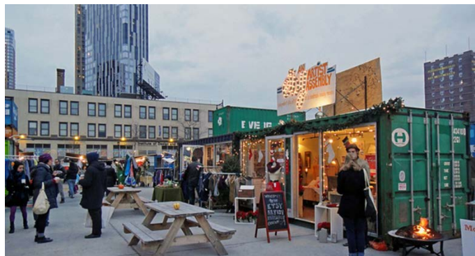
FIGURE 3.3.5 Shipping Container Pop-up Market