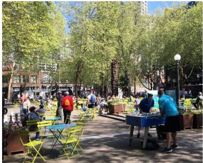
FIGURE 2.1.1 Activated public park with games and street furniture