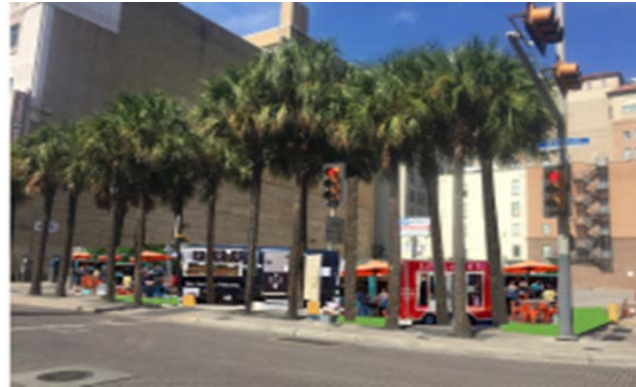
FIGURE 3.1.1 Intersection of Presa and Jefferson Tomorrow

The intersection of Presa/Jefferson and Houston is dominated by the presence of a surface parking lot today; this could be used as a testing ground for retailers who could become longer-term tenants of storefront spaces.