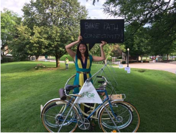
FIGURE 3.3.0 Grass roots community engagement