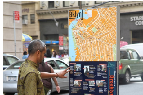
FIGURE 1.11 Downtown Brooklyn wayfinding signage