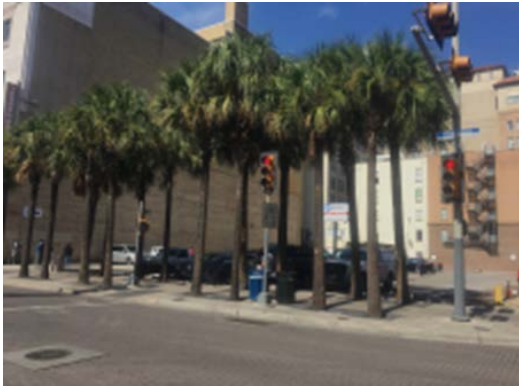
FIGURE 3.1.0 Intersection of Presa and Jefferson Today