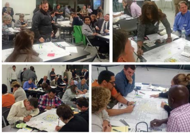
FIGURE 1.13 Community engagement work sessions