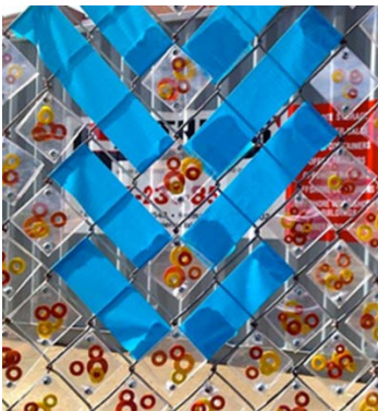
FIGURE 2.2.11 Construction Fence Art Work (example 1)

The historical elements along Houston Street could be more interactive with the addition of translucent historic “before” photos positioned over their present-day condition so that visitors can see the “before” over the current “after.”