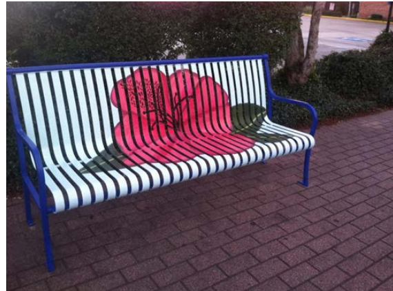
FIGURE 2.2.2 Locally painted street furniture

Stakeholders shared that a lack of “stickiness” or staying power was a common challenge on Houston Street, along with empty storefronts. By establishing the “distrito” and committing to using culture and the arts as a placemaking tool, the challenges become assets as the stickiness is reimaged in a new way by highlighting the street’s theatres, its strongest assets, and funneling that momentum into a ready inventory of empty storefronts without having to build new spaces. The creation of a theatre distrito is one option; however, if desired, micro-districts could be imagined along Houston Street as hubs of identity that Houston Street connects together, creating interest and a desire to see what the next block has to offer.