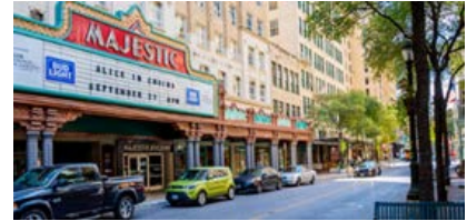
FIGURE 1.2 The Majestic Theater

The Performing Arts Segment: This segment is the most active and established local-centric node of Houston Street. Tourists will likely venture into this segment, but it will be more populated by local residents. This segment stretches from Broadway Street to North St. Mary's Street.