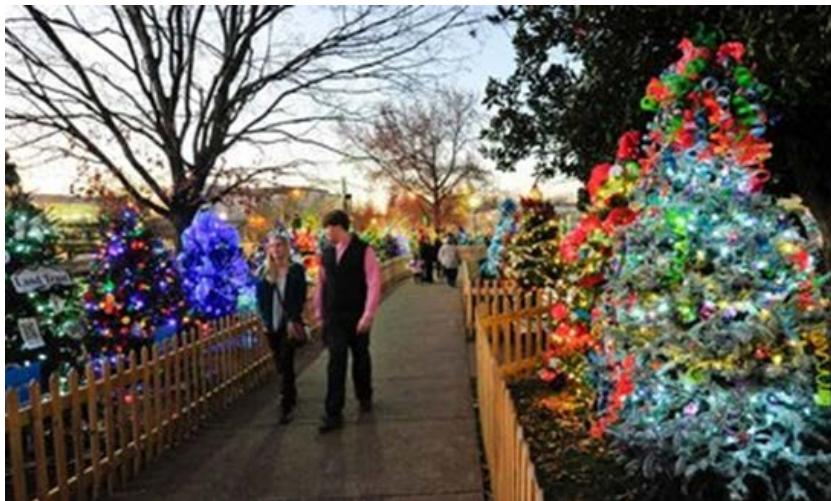
FIGURE 2.4.1 Downtown Tinsel Trails

The seasonal activation strategy should be centered around the beautiful colors that define this segment including those of the Alameda Theater and El Mercado. These bright, thematic colors could be extended into seasonal holiday activations located in Milam Park. With its extensive path network, Milam Park is ideal for a strolling holiday experience such as a "tinsel trail", 14 a "pumpkin trail" 15 , or another seasonally-connected trail. The Christmas trees or pumpkins can be designed by local businesses with the trails being located along the pathways of Milam Park. This type of trail is typically free to enjoy and can be maintained during its operation in a partnership between Centro and the City's parks division. One can imagine beautiful and brightly designed temporary Christmas trees and Halloween pumpkins that add to the vibrant permanent colors of the Alameda and El Mercado.