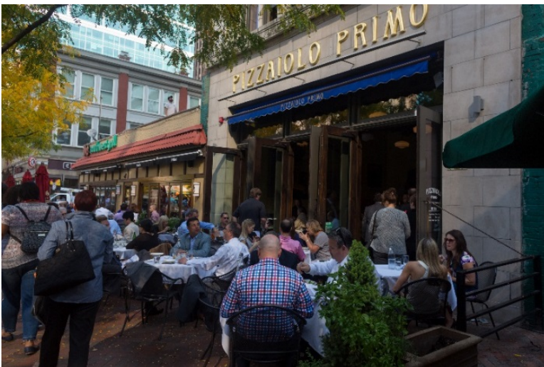
FIGURE 1.7 Outdoor Seating