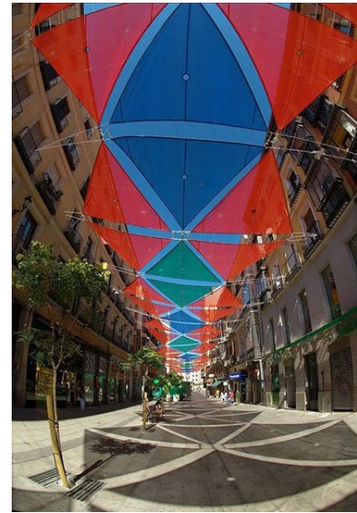
FIGURE 2.3.2 Geometric Shade Coverings

For instance, digital ticker tapes are popular in iconic urban areas like Rockefeller Plaza. These can double as both functional signage and interactive displays. One can imagine an LED screen in the Innovation Segment where pedestrians could watch TED Talks or other streaming experiences directly from the sidewalk. These types of digital signage can both entertain and inform--neither being exclusive of the other.