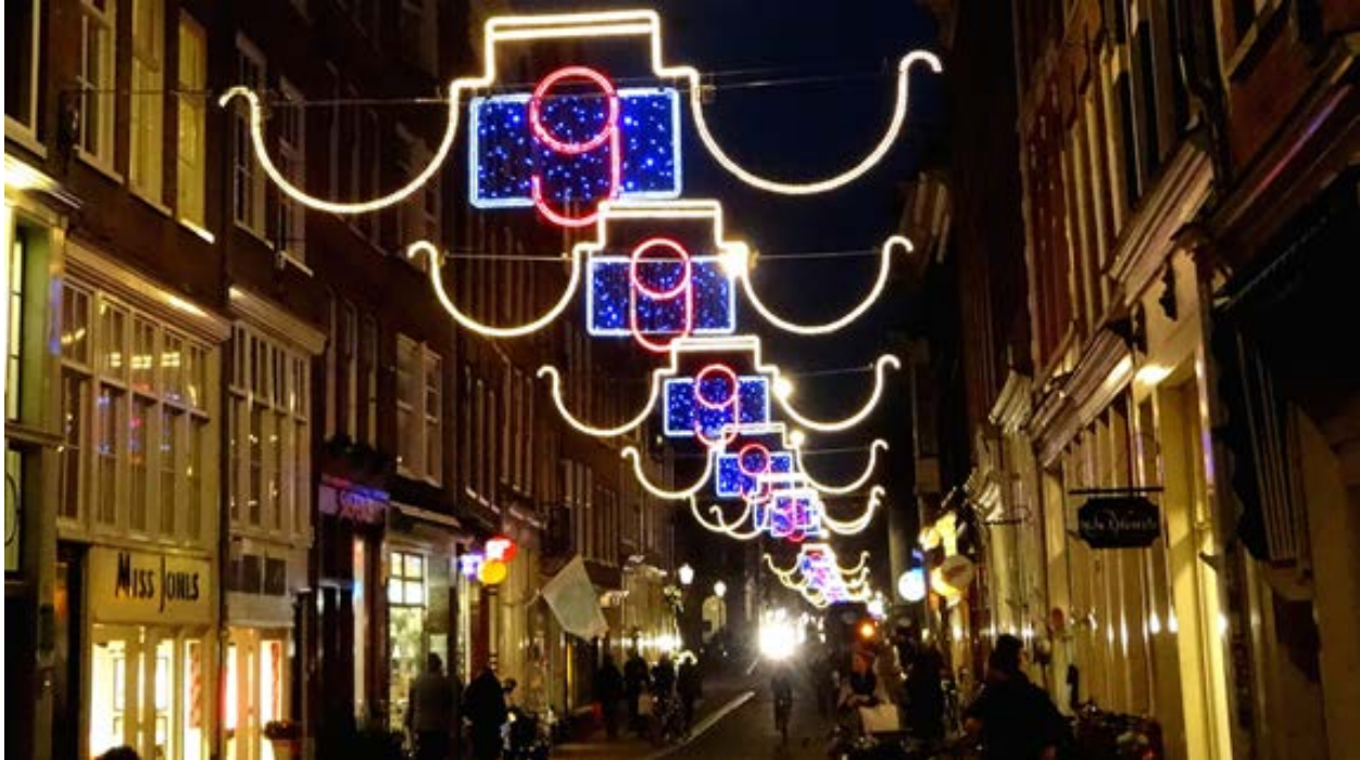
FIGURE 3.2.2 One of Amsterdam’s Nine Great Streets that bisect their Houston Street equivalent provides an enjoyable, appealing, and safe entry and exit along the corridor 16 .