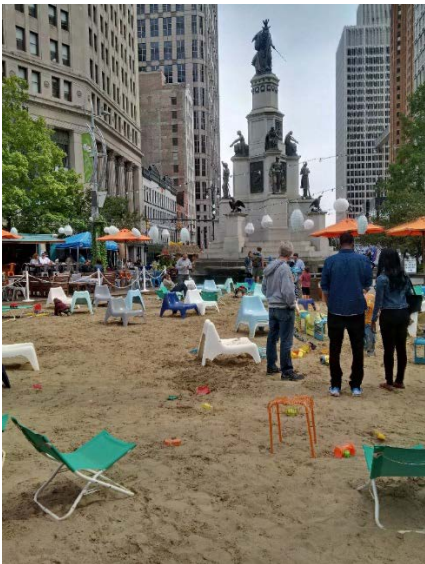
FIGURE 1.5 Beach activation in downtown