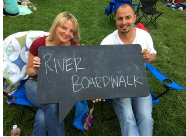
FIGURE 3.3.1 Community engagement and interaction

The vacant windows and ticket booths along Houston Street present an interesting opportunity to encourage public participation and provide information that may guide online participation. Take public engagement to the next level and partner with the media to spread the word. Let the community know that they drive the development and future activations along Houston Street.