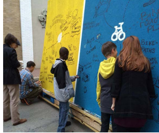
FIGURE 2.2.16 Interactive Community Art Walls