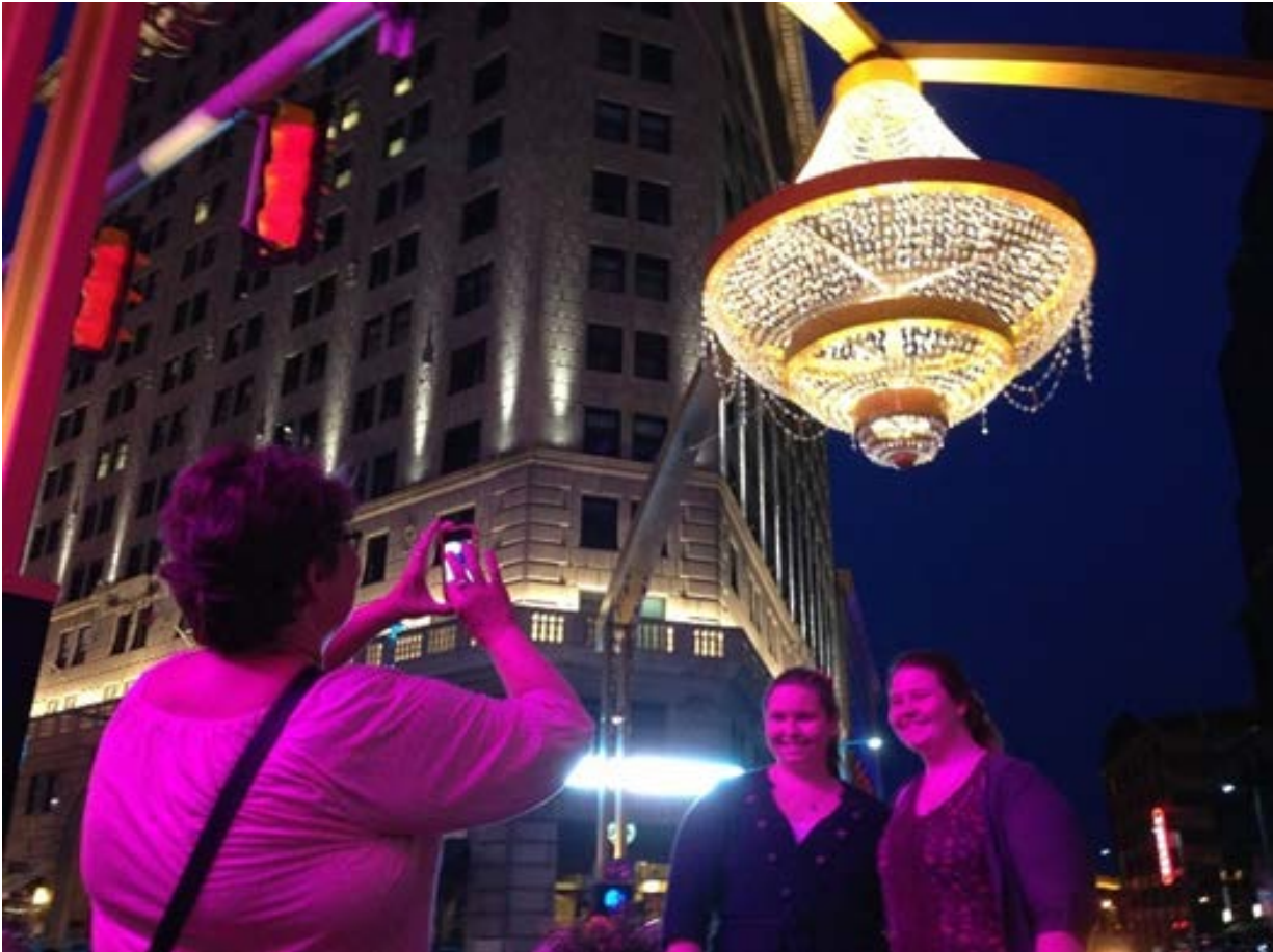
FIGURE 2.2.0 Playhouse Square, Downtown Cleveland chandelier

Houston Street provides an incredible opportunity to cultivate a draw for locals and visitors alike with the concentration of historic theatres. The creation of a special performing arts district along the Houston Street Corridor, even if de facto, sends a message to community activators to focus performing arts efforts within this compact area, creating a place for the critical mass of performing arts and all of its supporting arts and businesses to thrive. Further, this segment is well positioned to preserve and appreciate the history, culture, and authenticity of San Antonio. By celebrating the arts through a designated district, the historical significance of arts along Houston Street can be amplified and celebrated as a contemporary expression of what it means to be a San Antonian.