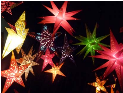
FIGURE 2.2.7 Downtown Street Lanterns

Lighting could be the most interesting placemaking tool and opportunity for Houston Street. As a theatre distrito, lighting could help Houston Street become the brightest street in Texas with creative lighting that illuminates and inspires even becoming a secondary district: “the light distrito”.