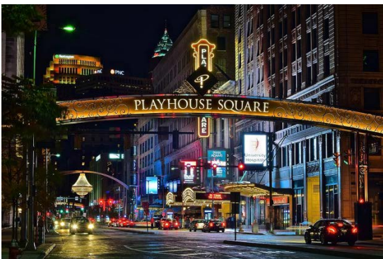
FIGURE 3.3.4 Playhouse Square Arch