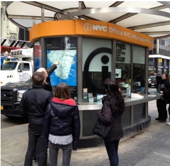
FIGURE 2.1.0 Interactive NYC kiosks