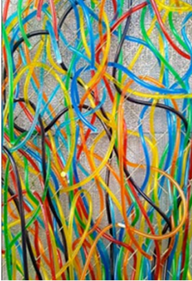
FIGURE 2.2.13 Construction Fence Art Work (example 3)