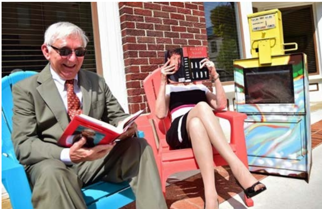
FIGURE 2.4.0 Downtown Huntsville Library Program

To accomplish this, the partners adaptively repurposed unused Huntsville Times newspaper racks by converting them into free library book borrowing stands. Each of the book boxes were placed in easily accessible and heavily trafficked areas of the city center including outside downtown residential lofts, office buildings, and the downtown YMCA. However, rather than simply replace newspapers with books in these unused stands, the partners decided to turn this initiative into a public art project. To accomplish this, Arts Huntsville promoted the project among the local arts community. In particular, local artists were invited to submit proposed Book Box designs with the winners being commissioned to create one box each. Once the locations were selected and the Book Box designs were completed, the Public Library system stocked the boxes with books. When doing so, the Public Library carefully stocks the Book Boxes with titles and genres that appeal to all ages. To date, the selections have been popular with an estimated 2,000+ books borrowed since inception.