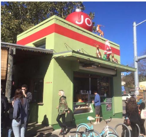
FIGURE 2.2.17 Pop-up Markets seasonally decorated

Incubating pop-up shops with micro-retail spaces to house enterprises such as snowballs, popsicles, coffee and fresh juices can activate public spaces and thoroughfares and can build a loyal clientele for existing or potential Houston Street operators. Employ a retail incubation program experiment to find a formula that works with appropriate lease lengths of three months or longer. Additionally, pair spaces with professional development courses to set operators up for entrepreneurial success by incubating them with bookkeeping, employee management, and marketing classes likely already offered by economic development organizations in the area. For a starting place, activators should study the lessons and successes from Raising the Barn that established a pop-up zoning district in Alamo Heights. A good place for this would be underutilized park space or surface parking lots. 10