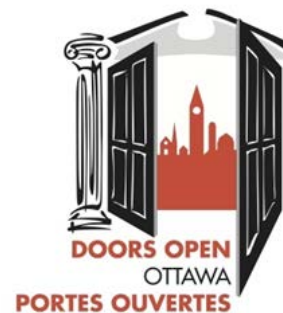
FIGURE 2.2.6 Doors Open Ottawa

Activators could encourage theatres to go out and perform scenes beyond Houston Street in the surrounding neighborhoods. This type of engagement can also be beneficial to the efforts of Centro and the City of San Antonio by engaging residents, possibly with youth outreach and pre-or post-performance improv games. Improv games can be a very useful city-planning outreach tool that makes