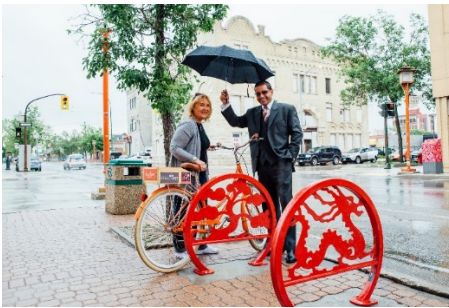
FIGURE 1.9 Downtown Winnipeg Bike Racks