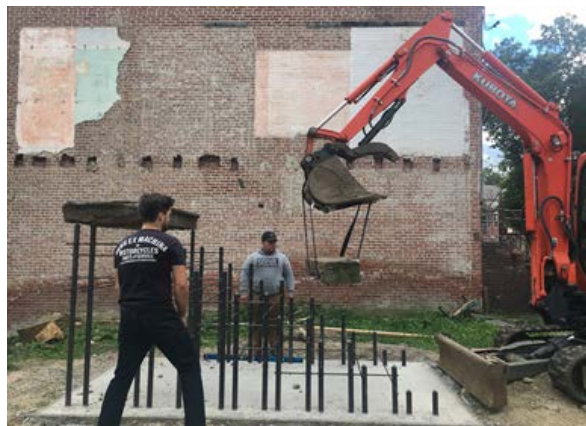
FIGURE 2.2.4 Artists enhancing their set in public

Houston Street can benefit from encouraging a variety of uses at all times of day at museums, other cultural institutions, and buildings such as coffee shops, bookstores, or other public interest purposes.