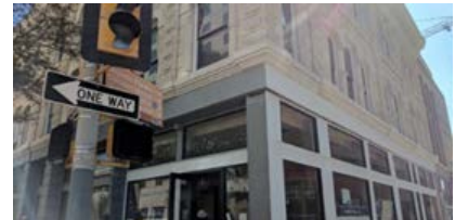
FIGURE 1.3 Construction within Innovation Segment

Innovation Segment: This segment is small and less-defined, but appears to be the beginning of an innovation and tech cluster on Houston Street. This segment is less linear and will, therefore, requires activation in the connecting areas along Houston Street as well including surface parking lots, Frost Park, and along the new Frost development site.