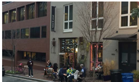
FIGURE 3.1.3 Storefront outdoor seating