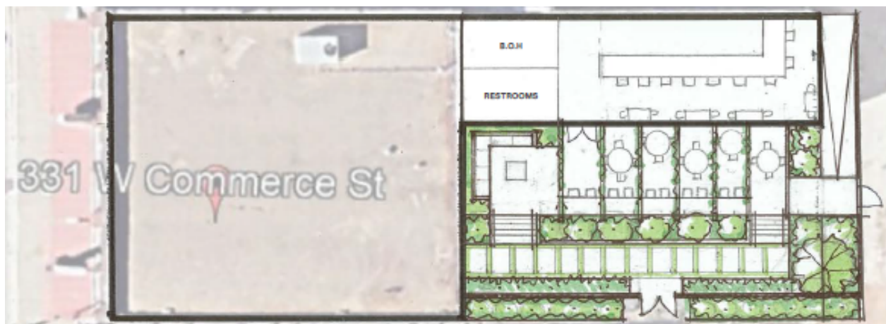
Sample Landscape plan for rear patio overlooking the creek development