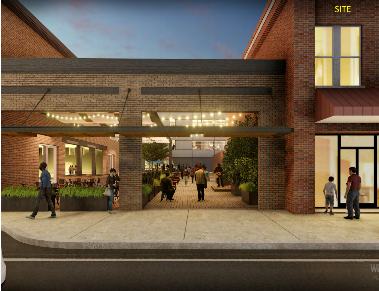
Selective demolition of adjacent building will create new courtyards, patios, and paseos through the buildings in this corridor